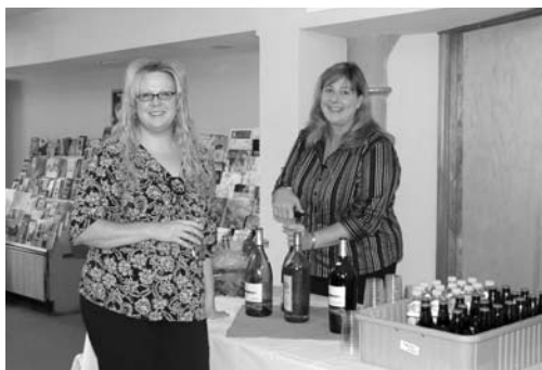
HELLS CANYON VISITOR BUREAU 504 Main St. Suite 320, Lewiston

A good time was had by all at the Hells Canyon Visitor Bureau Ribbon Cutting on Thursday, November 6.